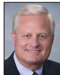
Hon. Bob Donchez Mayor City of Bethlehem