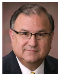
Hon. Sal Panto, Jr. Mayor City of Easton