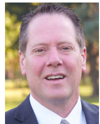
Hon. William B. McGee Councilman Northampton County Council